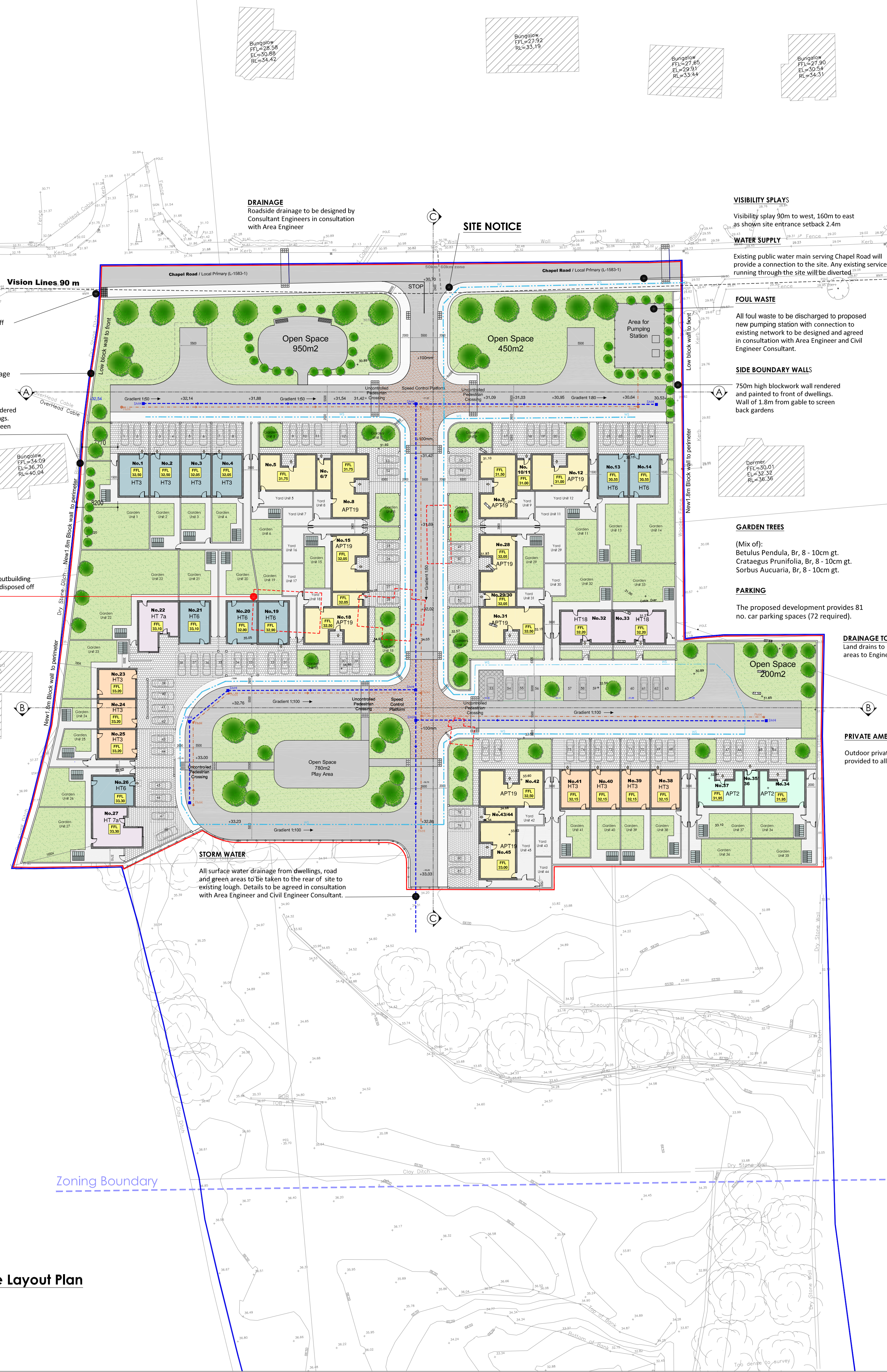
Proposed Site Layout Plan Scale 1:500